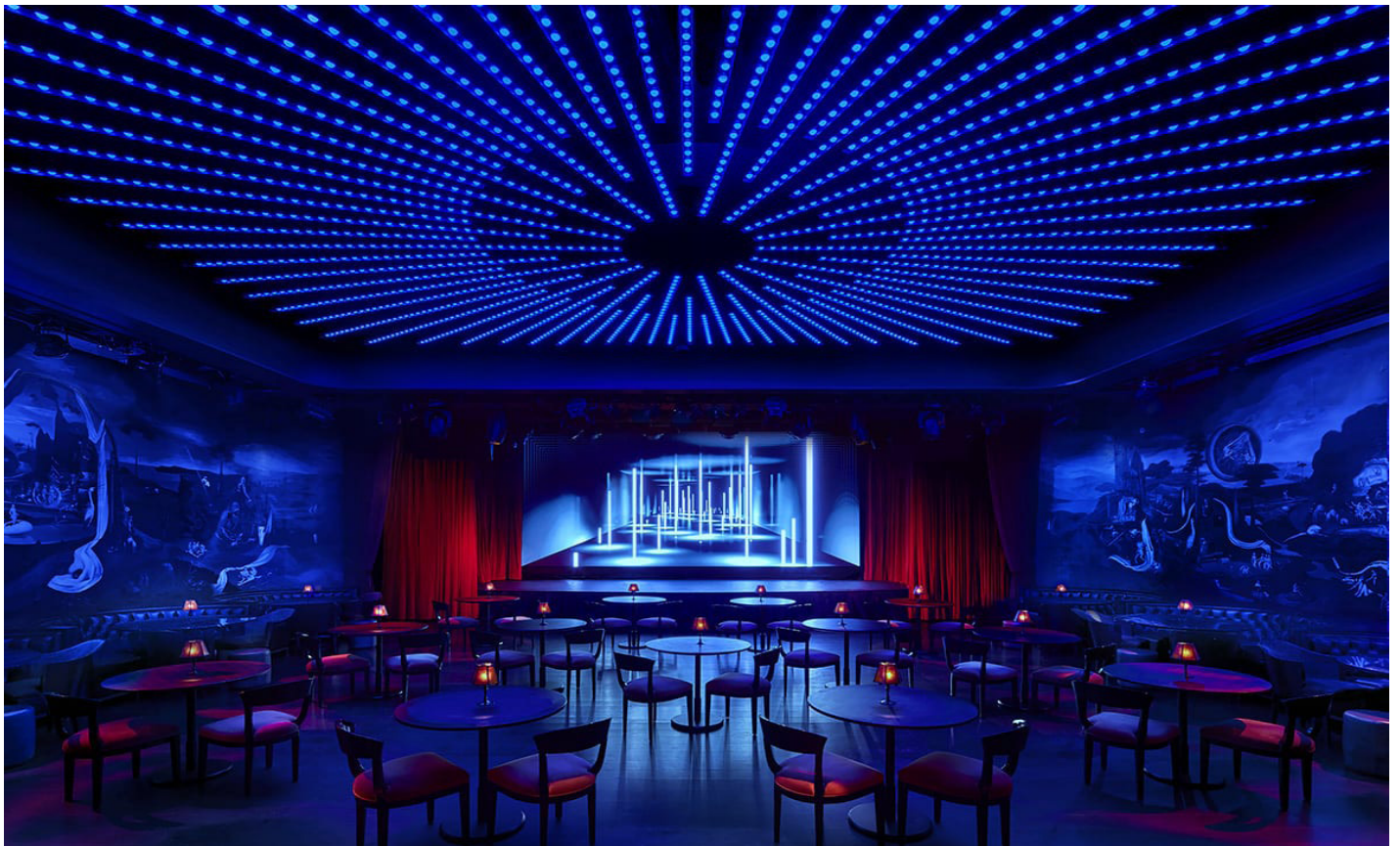
PARADISE CLUB AT THE EDITION HOTEL, TIMES SQUARE, NEW YORK, NY, USA